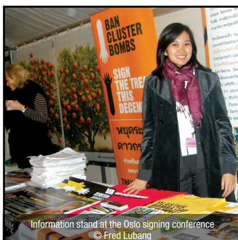
Information stand at the Oslo signing conference