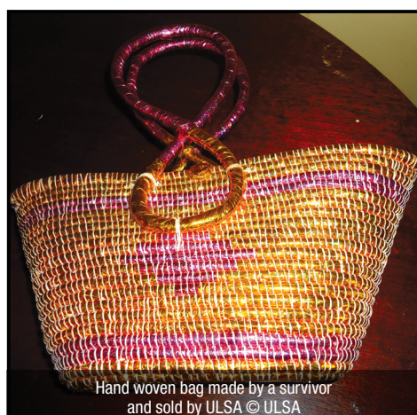
Hand woven bag made by a survivor and sold by ULSA

This might seem like a lot of work before you even start writing – particularly if there is a looming deadline for proposals – but the information gathered by the questions above is essential to your chances of success. This is a “make or break” step in project planning and proposal writing.