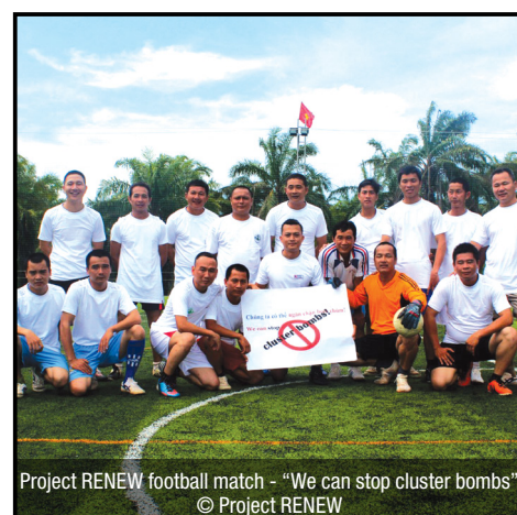
Project RENEW football match - “We can stop cluster bombs”