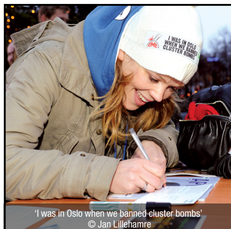
'I was in Oslo when we banned cluster bombs'

“When I was new to campaigning on cluster bombs, it was great to know that the Cluster Munition Coalition is such a huge resource. All I had to do was to look at the CMC website and/or write to the secretariat.”