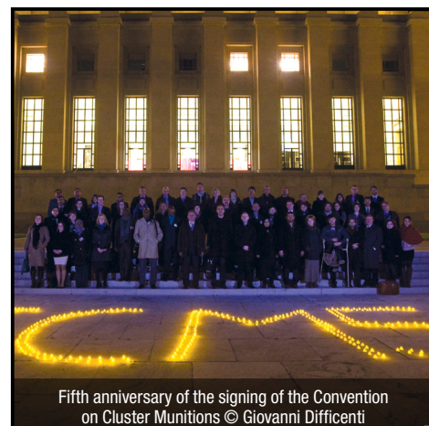
Fifth anniversary of the signing of the Convention on Cluster Munitions