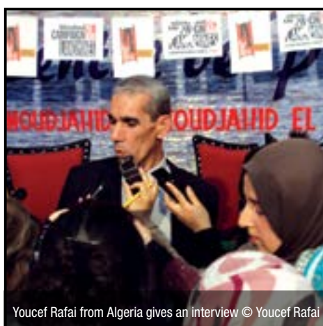
Youcef Rafai from Algeria gives an interview