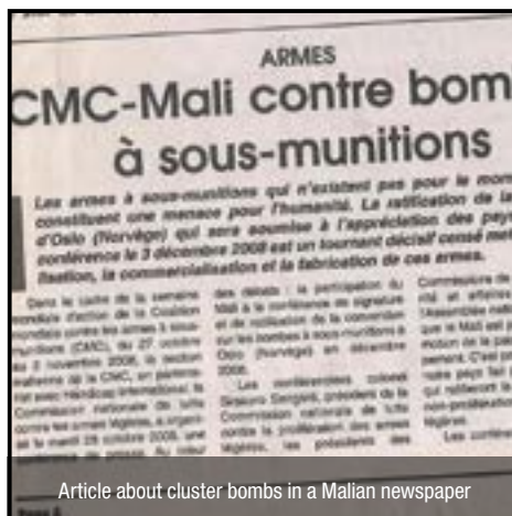
Article about cluster bombs in a Malian newspaper