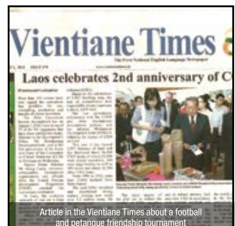
Article in the Vientiane Times about a football and petanque friendship tournament