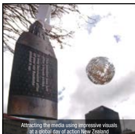
Attracting the media using impressive visuals at a global day of action New Zealand

After you send a press release out, it helps to follow up with phone calls to see if journalists received it and are interested in covering it, as well as to offer your help if they need more information or want an interview. This also makes sure that your press release does not get dumped in their spam folder. Don't lose heart if your press release isn't covered – there might just have been bigger news stories. It's ok to ask journalists why it has not been picked up to learn for next time.