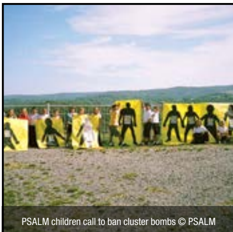
PSALM children call to ban cluster bombs

“If you’re organising a public action, spread your message wide by printing campaign resources you can disseminate. There are materials on the CMC website that you can use or adapt.”