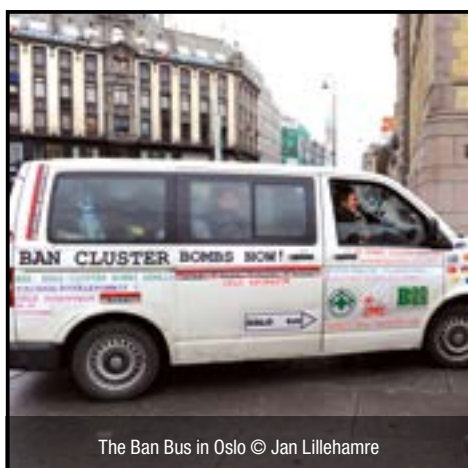
The Ban Bus in Oslo

“When government officials did not take action on something, we would organise an event and mobilise survivors to join, because these type of activities are normally covered by media.”