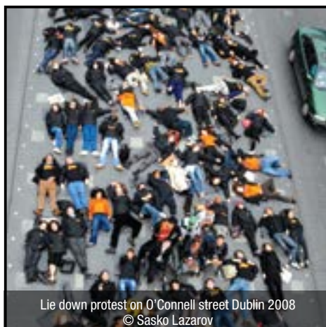
Lie down protest on O'Connell street Dublin 2008