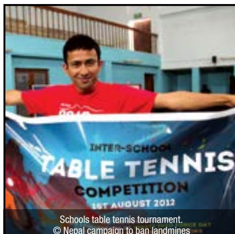
Schools table tennis tournament.