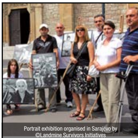
Portrait exhibition organised in Sarajevo by ©Landmine Survivors Initiatives