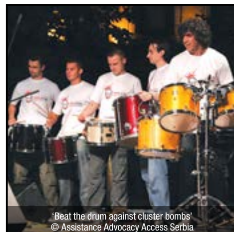
'Beat the drum against cluster bombs'