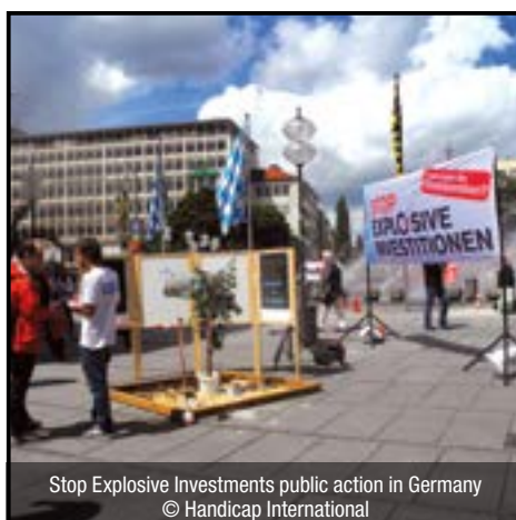
Stop Explosive Investments public action in Germany