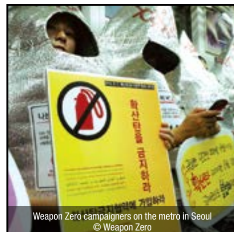
Weapon Zero campaigners on the metro in Seoul