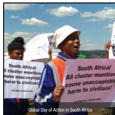
Global Day of Action in South Africa